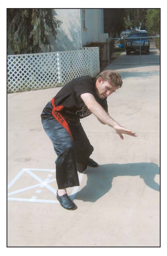
Juru 1 - 9