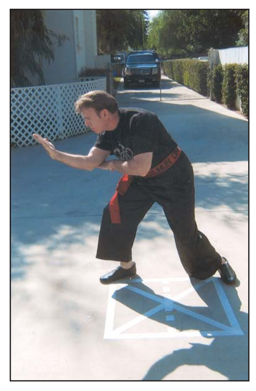
Juru 1 - 11