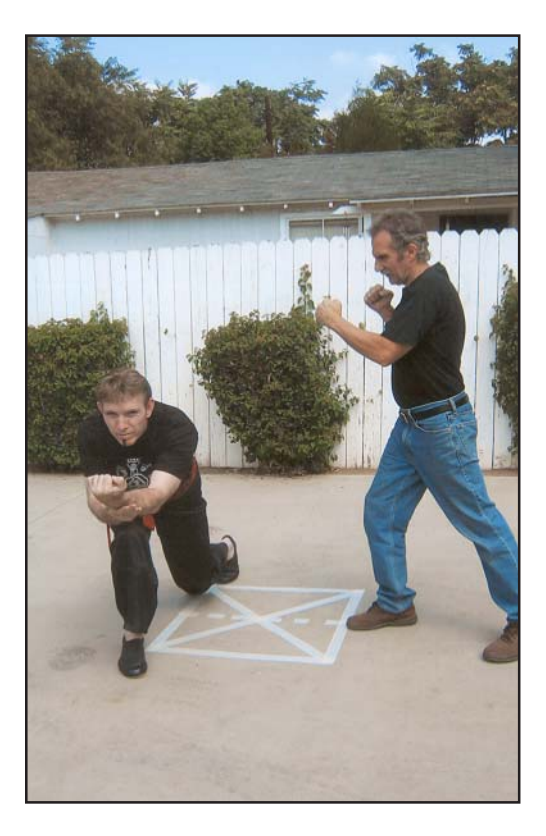
Juru 1 Application 1

It is very evident I am oblivious in appearance to the attacker.