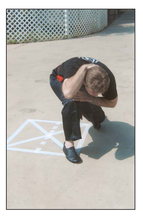
Juru 1 - 7

Since the last blow was high we now practice changing the height picture so we drop out of the attacker's line of site for a moment (great way to get leg strength for a variation of height off timing while fighting). Notice the back of the neck is protected as it becomes exposed. This also evades a counter blow possibly thrown in reflex by the attacker.