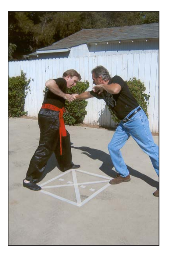
Juru 1 Application 7

Here one can see the cocking of the right elbow in preparation to either parry his left or continue the assault.