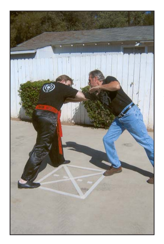
Juru 1 Application 8

Here one can see the cocking of the right elbow in preparation to either parry his left or continue the assault.