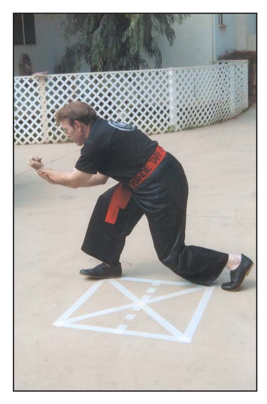
Juru 1 - 13