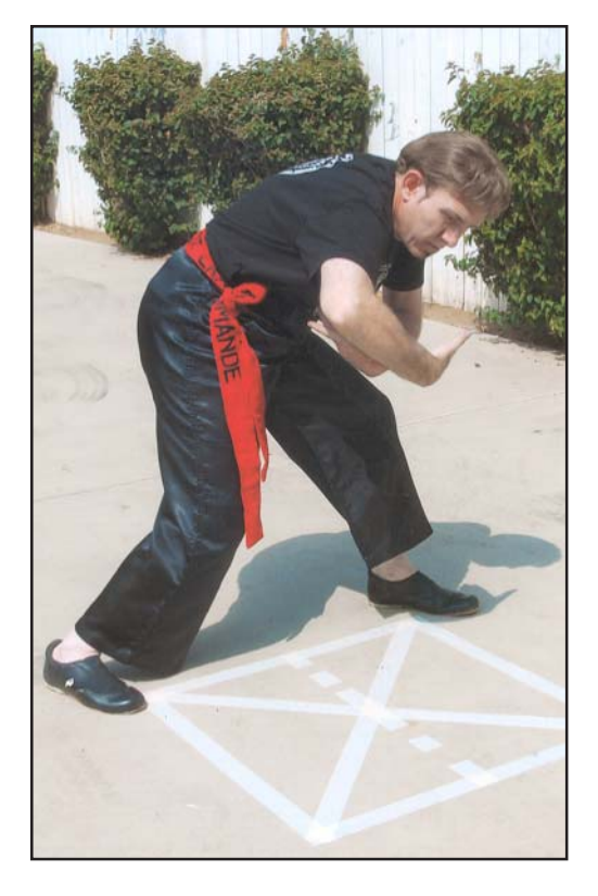
Juru 1 - 2

Here on the base line of the Juru it is important to look in the direction of the line on the ground and not at the opponent. Indirect vision is always used in the Juru practice and it is as important as any of the physical movements. Also one must pay attention to the height of the practitioner, not standing up straight like a boxer, having a parallel position in relation to the attacker and good bend in the knees, with the thought here of protection at a distance, keeping the center line away from the attacker and keeping the vulnerable knee joints for now far away.