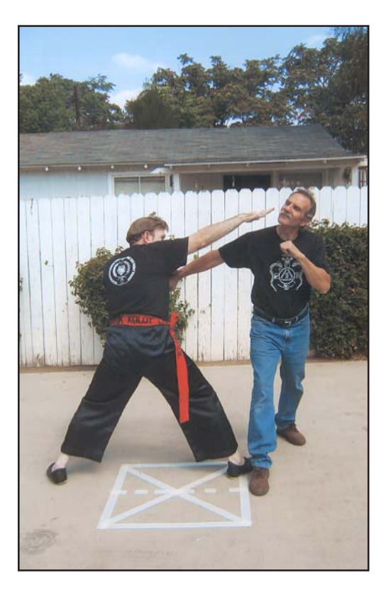
Juru 1 Application 9

As he pulls to escape I finally advance my right leg with him in the Principle of Adhesion striking him here high in the eye region.