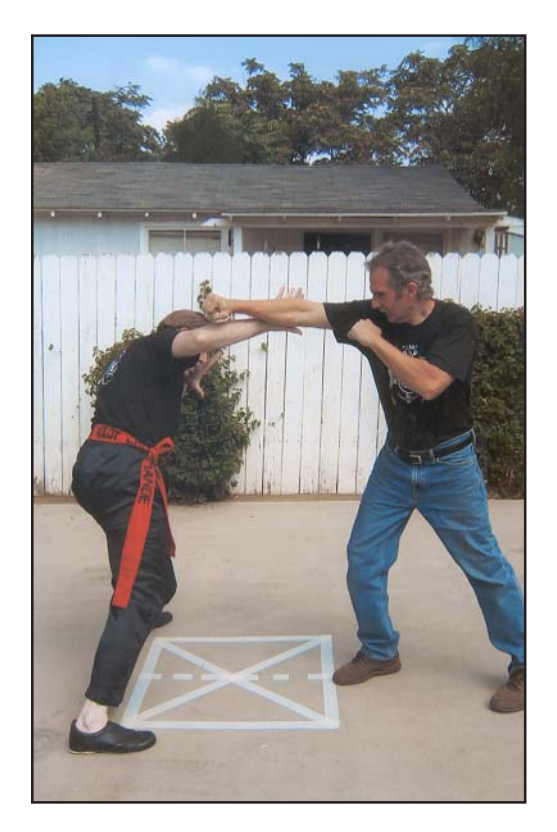
Juru 1 Application 4

I did not advance my feet so when he does strike I am still at a safe distance.