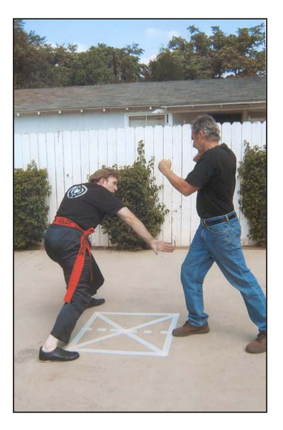
Juru 1 Application 3

As my hand drops one can see the obvious opening I have created near my head for him to strike.