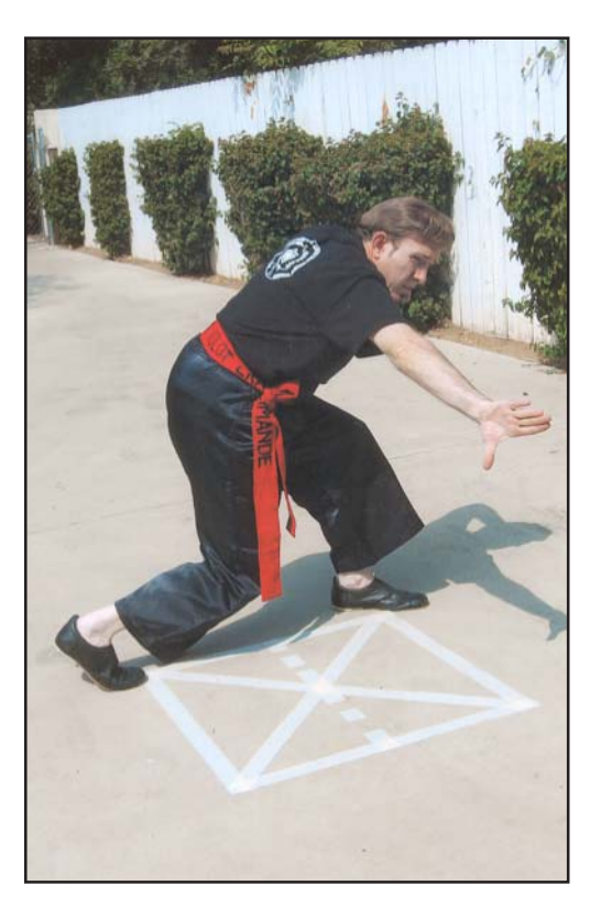
Juru 1 - 3

Now the lead hand is extended to give a false sense that the person is closer to the attacker, the end of the hand is seen as the body of the attacker, and it is placed in a low position to invite an attack over it. Here one learns to control space by creating false boundaries using parts of the body, while keeping the body in a safer zone.