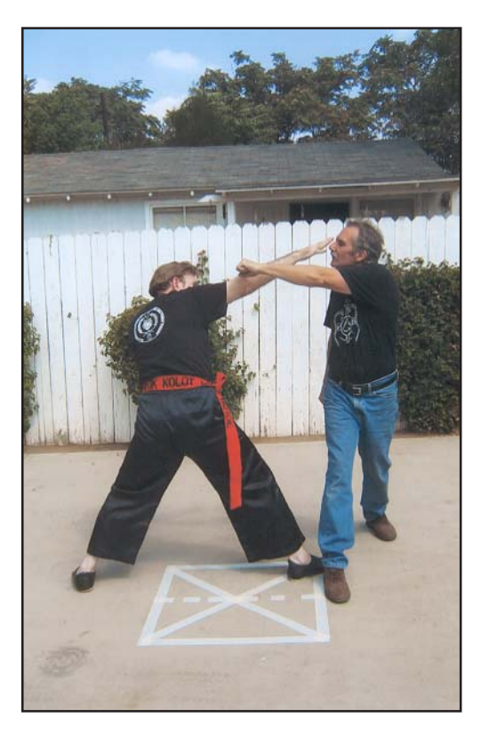
Juru 1 Application 11 - 12

I rise here and using my back hand to further hit parry his arm out of the way.