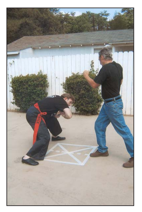
Juru 1 Application 2

It is very evident I am oblivious in appearance to the attacker.