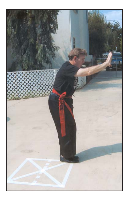
Juru 1 - 10