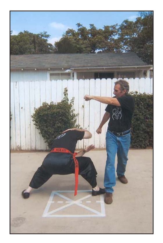
Juru 1 Application 10

As he pulls to escape I finally advance my right leg with him in the Principle of Adhesion striking him here high in the eye region.