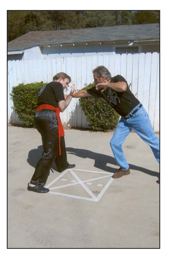
Juru 1 Application 6

Also notice I have angled my head out of harms way.