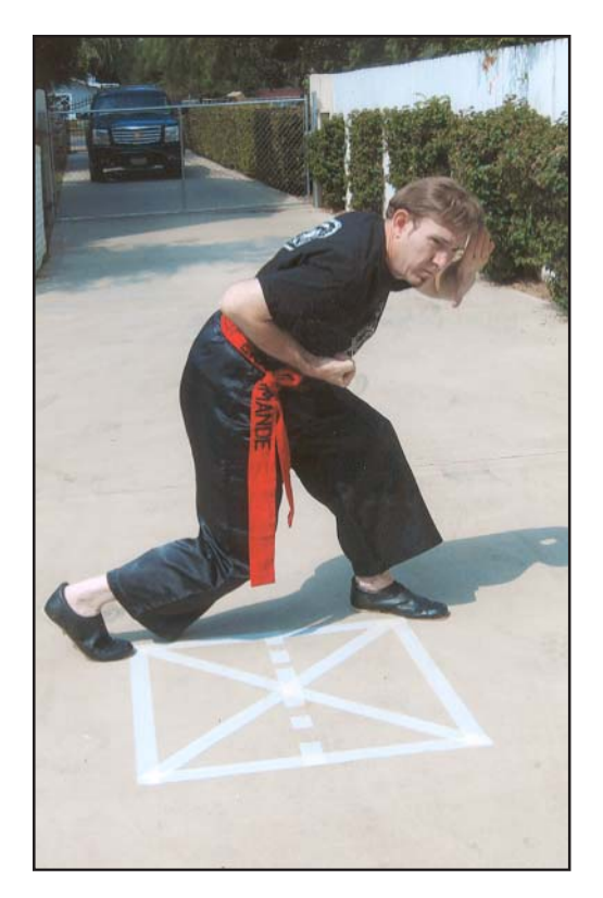
Juru 1 - 4

Now the lead hand is extended to give a false sense that the person is closer to the attacker, the end of the hand is seen as the body of the attacker, and it is placed in a low position to invite an attack over it. Here one learns to control space by creating false boundaries using parts of the body, while keeping the body in a safer zone.