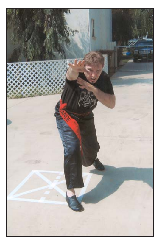
Juru 1 - 6

Here that arm that was monkey grabbed is being struck with the elbow. What is not seen is before it was struck it was quickly transferred to the left hand grasp while the right elbow is launched. Body mechanics are more easily seen in the two man practice sequence.