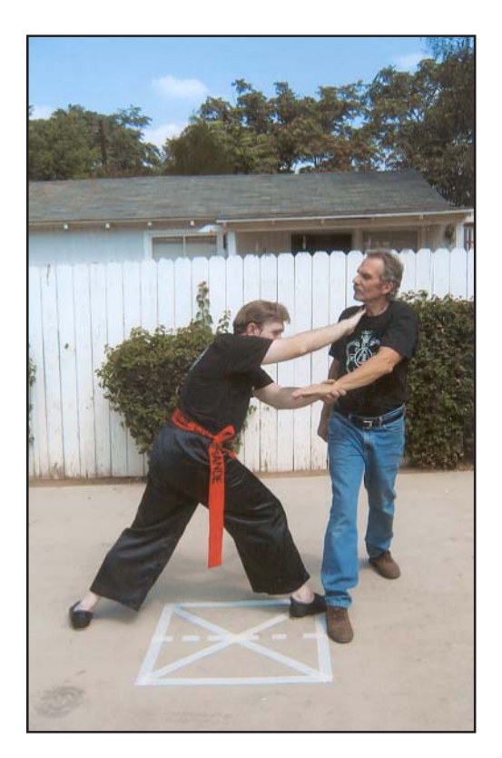
Juru 1 Application 13

Using the Principle of Ricochet hitting I quickly reverse the strike and now to go left to right and drop it in his throat.