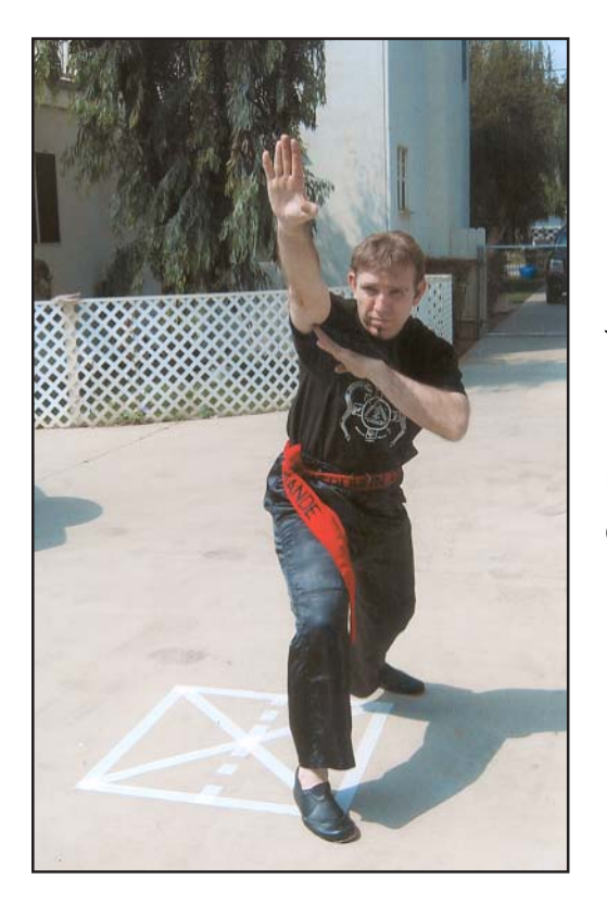
Juru 1 - 8

Since the last blow was high we now practice changing the height picture so we drop out of the attacker's line of site for a moment (great way to get leg strength for a variation of height off timing while fighting). Notice the back of the neck is protected as it becomes exposed. This also evades a counter blow possibly thrown in reflex by the attacker.