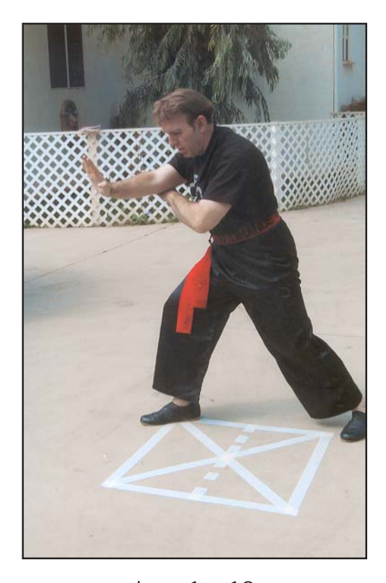
Juru 1 - 12