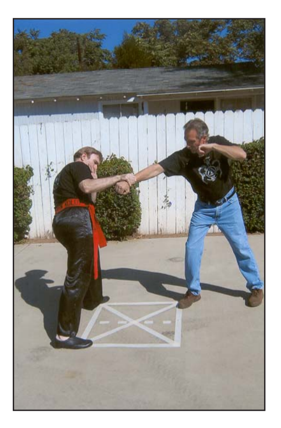
Juru 1 Application 5

Quickly I convert the hit parry to a monkey grab parry as he pushes back against my arm to rid himself of it.